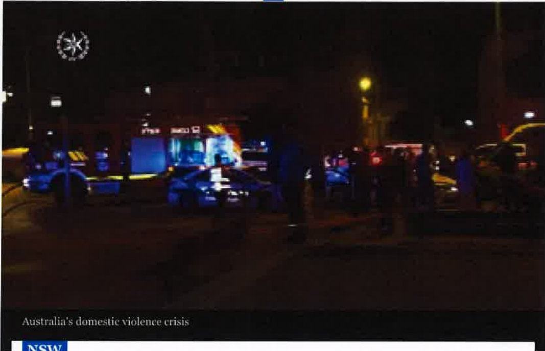
Australia's domestic violence crisis